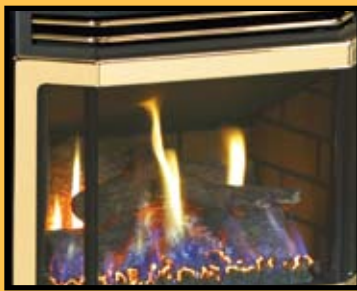
Shown with optional gold door crown and gold rod grille

The TrueGlow Burner, an exclusive from Quadra-Fire, sets a new standard for realism. The ceramic burner is molded from real wood pieces and coals. Flames rise from gas ports distributed throughout the glowing coal bed and lower logs, producing an incredibly active and varied fire. No need to hide the burner anymore—the TrueGlow burner proudly takes center stage, with an appearance that is phenomenal, whether it's burning or not.