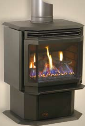
Shown standard black

An ordinary room becomes an inviting living space with the Columbia Bay from Quadra-Fire. Bay window styling, with your choice of black, gold or satin-nickel trim, adds just the right touch of class. Curl up in front of the fire and let the warmth and glow melt away the hassles of the day. High efficiency and great performance keep your heating bills down. And for even more convenience, add a thermostatic remote control.